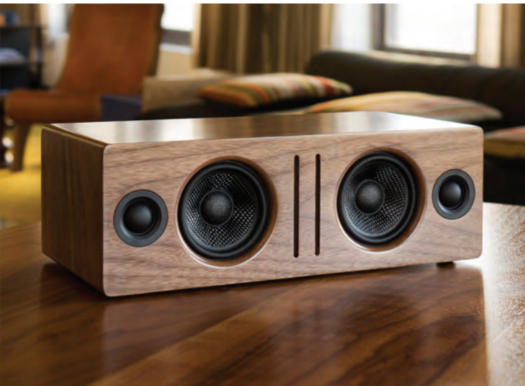
Audioengine B2 Premium Bluetooth® Speaker