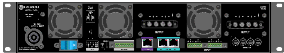
4|2400N model shown