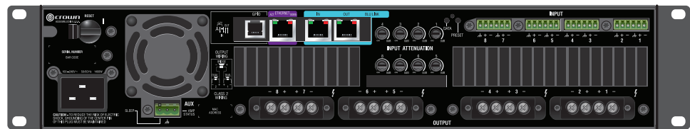
8|600N model shown