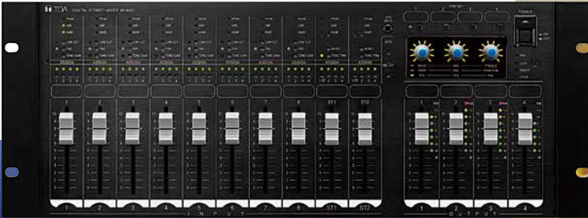
Digital Stereo Mixer M-864D

TOA's new M-864D digital stereo mixer maintains the basic functionality and operability of its predecessor, the M-633D, but adds such versatile features as analog-feel fader operation, 8 monaural and 7 stereo input channels, remote controller operation and fine-tuning of settings with GUI software. With its release, TOA has made the clear sound achieved by its proprietary resonance control technology available for use in hotel banquet rooms, multipurpose halls and other facilities that host events of various types.