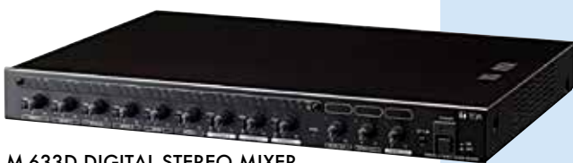
M-633D DIGITAL STEREO MIXER

For those who require superior sound quality with easy, one-touch operation in a single-purpose venue