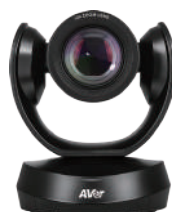
H182 x W142.7 x D153 mm