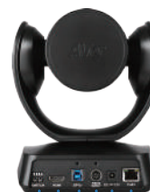
DIP switch HDMI out USB 3.1 type-B LAN for IP streaming and Power over Ethernet (PoE) DC 12V RS232 in/out