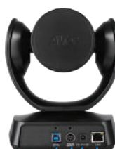
USB 3.1 type-B RS232 in/out LAN for IP streaming/ remote access DC 12V