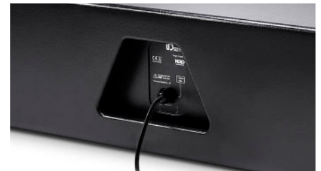
Rear panel connectivity / Installation version

IDS110 and IDS210 subs share the same phase response as other NEXO speakers, making them extremely easy to integrate in ID Series systems or systems using other NEXO modules.