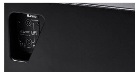
Rear panel connectivity / Touring version