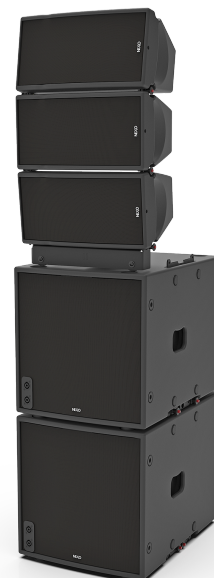
MSUB12 deployed in a stack array with GEO M6.

The MSUB12 shares the same phase response as other NEXO speakers, making it extremely easy to mix with other NEXO systems, e.g with the larger MSUB18 or with other NEXO subs, without risk of comb filtering or requiring complex electronic adjustment.