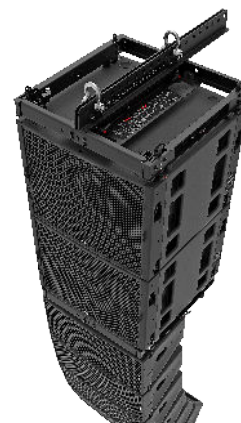
MSUB18 deployed in a flown array with GEO M12.

The MSUB18 shares the same phase response as other NEXO speakers, making it extremely easy to mix with other NEXO systems, e.g with the smaller GEO M10 or with other NEXO subs, without risk of comb filtering or requiring complex electronic adjustment.