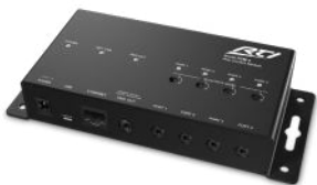
PCM-4 Port Control Module