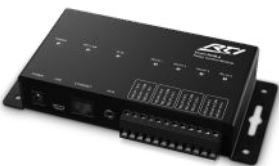
RCM-4 Relay Control Module