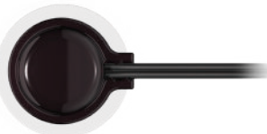
vIRsa Mouse® Infrared Emitter

The XP-3 is ideal for media rooms, bedrooms, meeting rooms and other small projects, delivering an exceptional level of control and automation in a small form factor. When paired with an RTI Remote, Touchpanel, or the RTI control app running on a mobile device, the XP-3 provides bi-directional control for two-way real time feedback from connected third-party devices such as music streamers, cable boxes, lighting systems, security, and more.