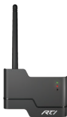
ZM-24 2.4GHz Zigbee® Transceiver