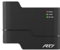
ZW-9 Z-Wave® Interface Module