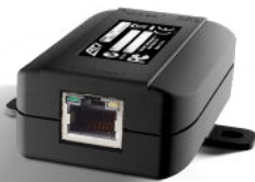
ESC-2 Ethernet to Serial Converter