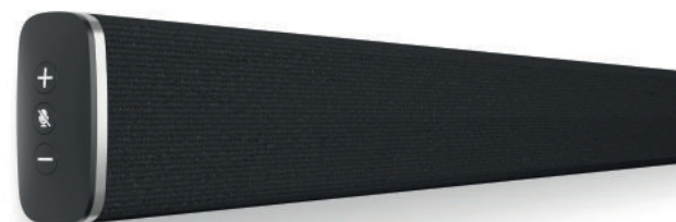
STEM WALL Controls