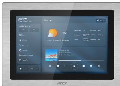
Brushed Aluminum Bezel