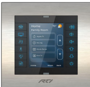
Brushed Aluminum Bezel