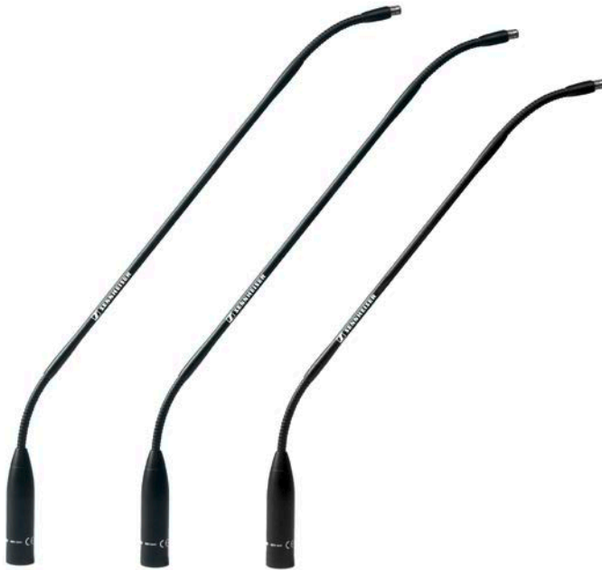
MZH 3072 MZH 3062 MZH 3042

Goosenecks for ME 34 | ME 35 | ME 36 microphone heads