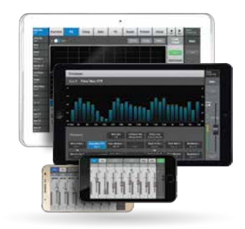
TouchMix Control App for iOS® and Android™ devices

In instances where Wi-Fi control is either not reliable or not desired, the elegant touch-and-turn interface of TouchMix allows for tactile control over fader and mixer parameters while also providing a reliable fixed hardware connection to vital mixer functions.