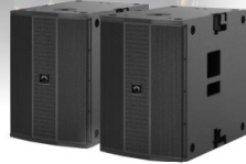
62LA ACTIVE LINE ARRAY