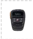
Wireless Remote Speaker Microphone