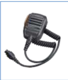
Wired Remote Speaker Microphone