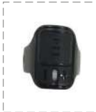
Wireless Ring PTT