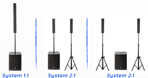
ACS-1200S Series application support