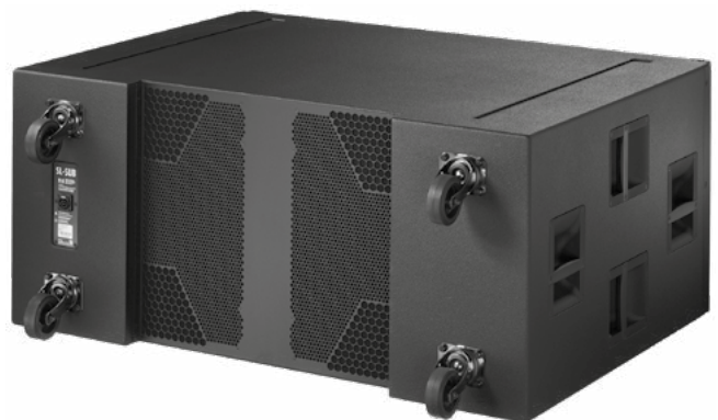
SL-GSUB for ground stacked applications